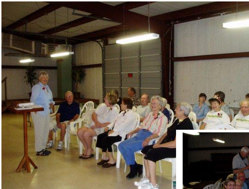
Devotions on Mother's Day Fredericksburg May Rally