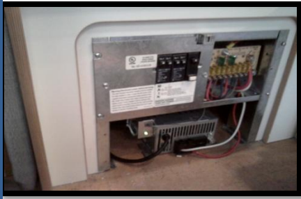
Iota DLS 55 multi-stage Converter/ Charger in space previously occupied by the Parallax 7355.

The charger voltage is lowered and held constant at a safe value of 13.5 volts DC, which prevents the battery from being overcharged, while allowing the charger to supply enough current to maintain the battery at a full state