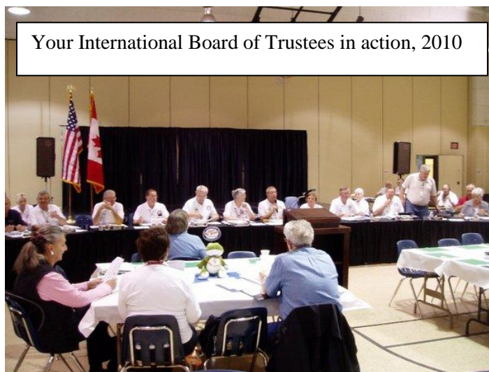
Your International Board of Trustees in action, 2010