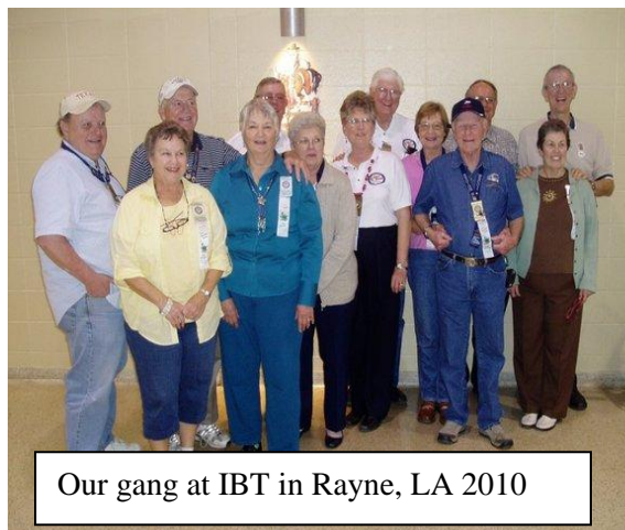
Our gang at IBT in Rayne, LA 2010