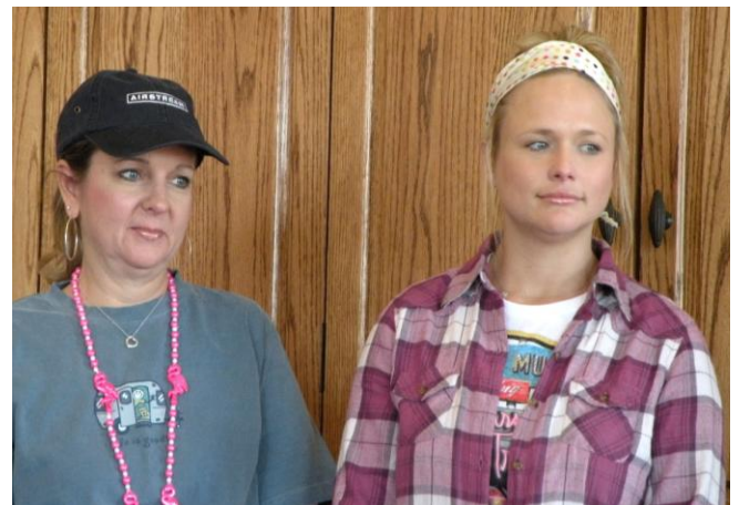
Who said Airstreamers are a bunch of old fogeys?

Tue, March 1: Unit Lunch at South Luby's located at US 290 & Brodie Lane