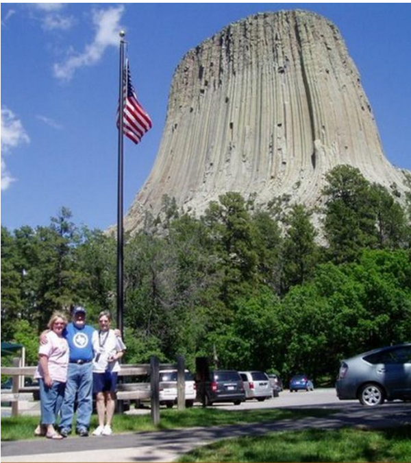
2010 WBCCI International Rally at Gillette, WY