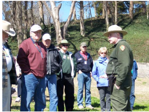
Battlefield tour with park ranger