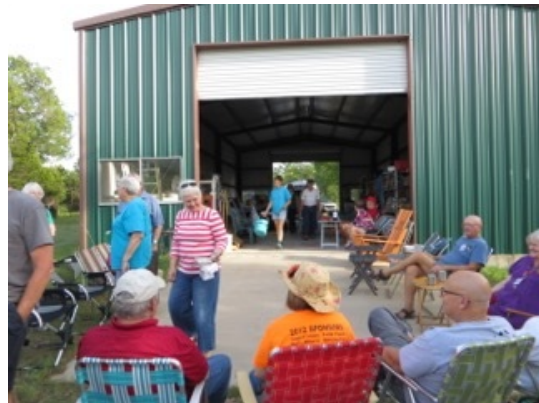
Happy Hour in the big, green barn.